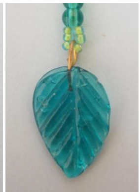
Loop End Page 11