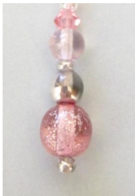
Standard Turn Bead End Page 10