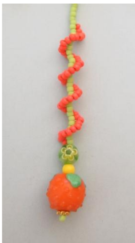
Spiral Fringe Page 80