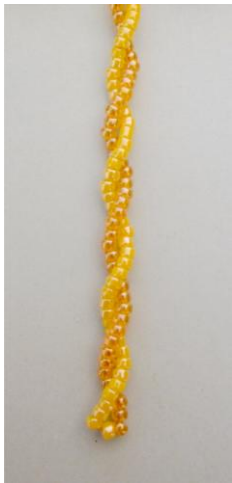
Twisted Fringe Page 77