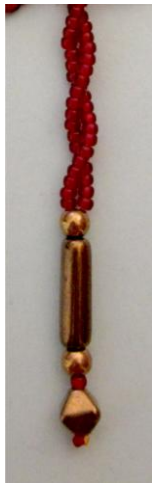
Twisted Variation Page 77