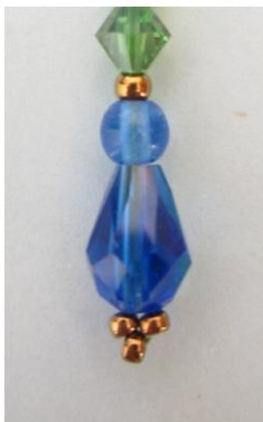
Picot End Page 10