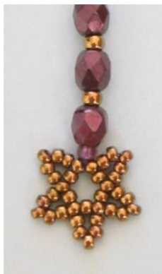
Star End Page 10