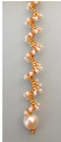
Ribbon Spiral Page 83