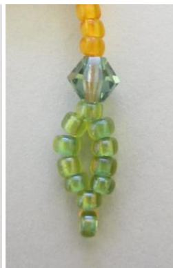
Leaf End Page 11