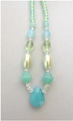
Loop Fringe Page 36