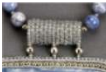
Square Stitch Bail DBE pg 82