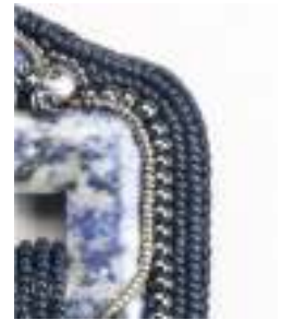
Sunshine Edge (Aka Basic/Raw Edge) DBE pg 65 BWC pg 20