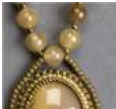
Added Bead Attachment DBE pg 85