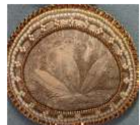
Diamond Bezel BWC pg 68