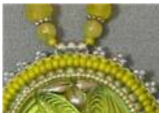
Turn Bead Attachment BWC pg 50