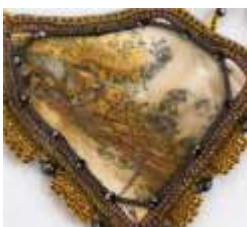
Bead Across Bezel DBE pg 58