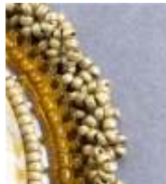
Circles Edge DBE pg 70