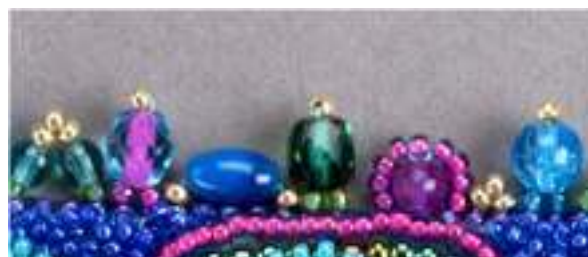
Free Form Edge DBE pg 75