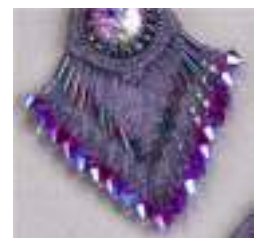
Fringe Edge DBE pg 77 BWC pg 44