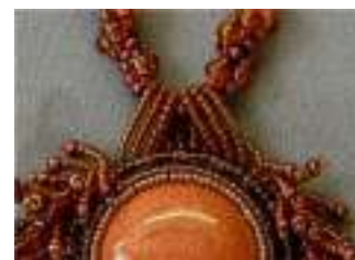
Top Loop Attachment BWC pg 57