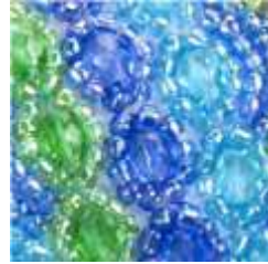
Chain-o-Beads stitch DBE pg 48