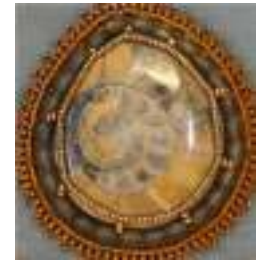
Window Bezel BWC pg 64