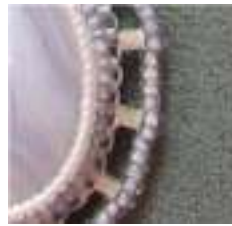
Lifted Turn Bead Edge BWC pg 27