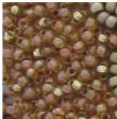
Picot Stitch (aka Moss Stitch) DBE pg 41