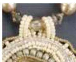
Herringbone Loop Attachment DBE pg 80