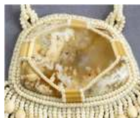
Bugle Row Bezel DBE 56