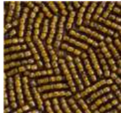
Lazy Stitch DBE pg 43