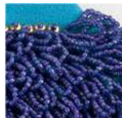
Loop Stitch DBE pg 42