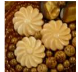
One Bead Stitch DBE pg 36