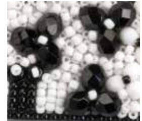
Clover Stitch DBE pg 45