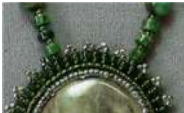
Direct Attachment BWC pg 47