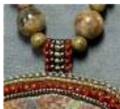
Ladder Stitch Top Bail BWC pg 55