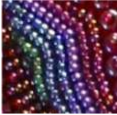
Backstitch DBE pg 38, BWC pg 16,18