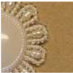
Scalloped Edge BWC pg 41