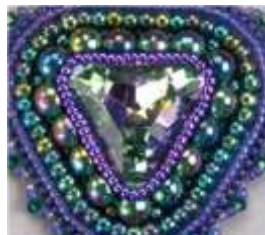
Bead Raised Bezel BWC pg 61