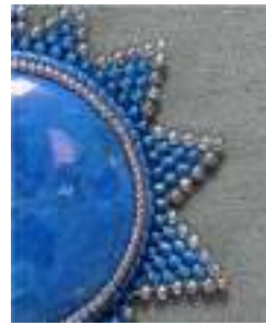
Star Edge with Brick Stitch BWC pg 35