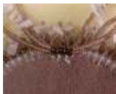
Backside Bead Attachment BWC pg 53