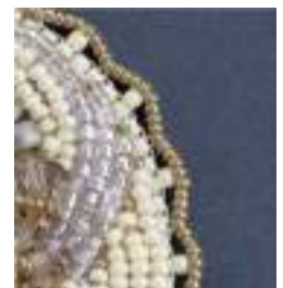
Wave Edge DBE pg 73