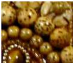
Couch Stitch DBE pg 40 BWC pg 62