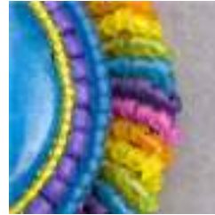
Rope Edge DBE pg 68